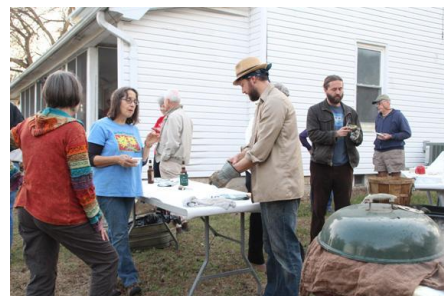
Oyster eaters and vegetarians alike connecting at Nottingham Center

As a community based organization we offer year 'round opportunities and a water side venue for watershed folk to assemble, connect and celebrate their common connection to the Patuxent River. Signature events like our Annual Oyster Roast/Potluck for members and Native American Storytelling events help us play a deeper role in a mobilized and informed citizen's lobby for clean water. Added to this are our newsletters, report cards, e-advisories, published articles, speeches, live river webcam and various works to promote conservation and clean water in the Patuxent River!