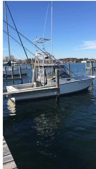
New Paxriverkeeper patrol boat