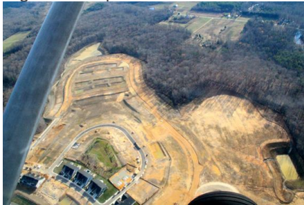
Aerial view of a Patuxent construction site

that continue to degrade the river. We periodically conduct upriver nutrient surveys carried out by citizens to detect pollution hot-spots so we can work to reduce and eliminate them. You can sign up to help with the 2017 survey: info@paxriverkeeper.org . Also through the generosity of two of our members in 2016 we added a new patrol boat to our fleet that when taken out of storage in Spring 2017 will increase the frequency, range and safety of our regular river patrols.